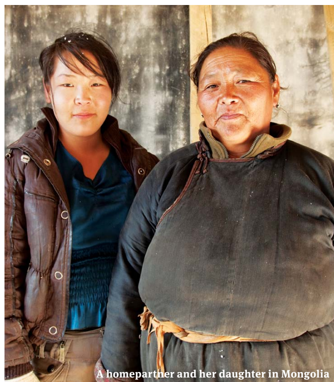
A homepartner and her daughter in Mongolia