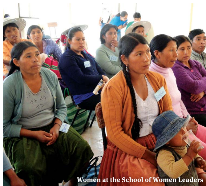
Women at the School of Women Leaders